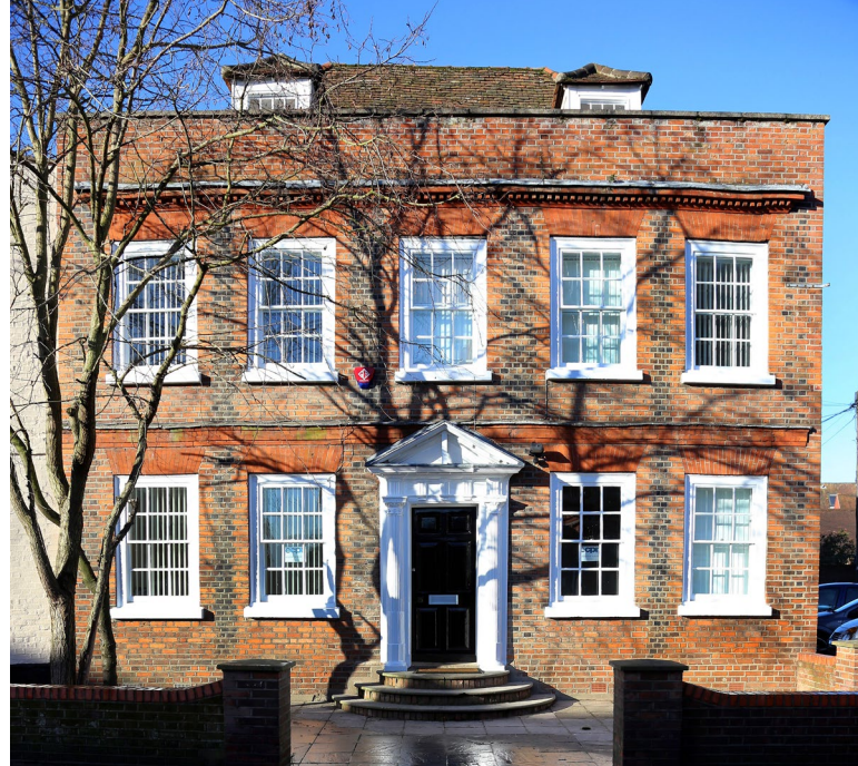
The front of Harbour House (above) and rear patio which has picnic tables in the spring and summer months (below)

Use of Harbour House by Standing Groups and Affiliates is encouraged but is not automatically granted. All requests will be subject to the discretion of the Executive Committee which will assess the nature of the request against current usage of the building.