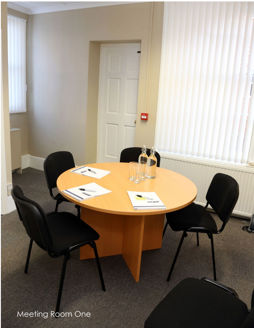
Meeting Room One