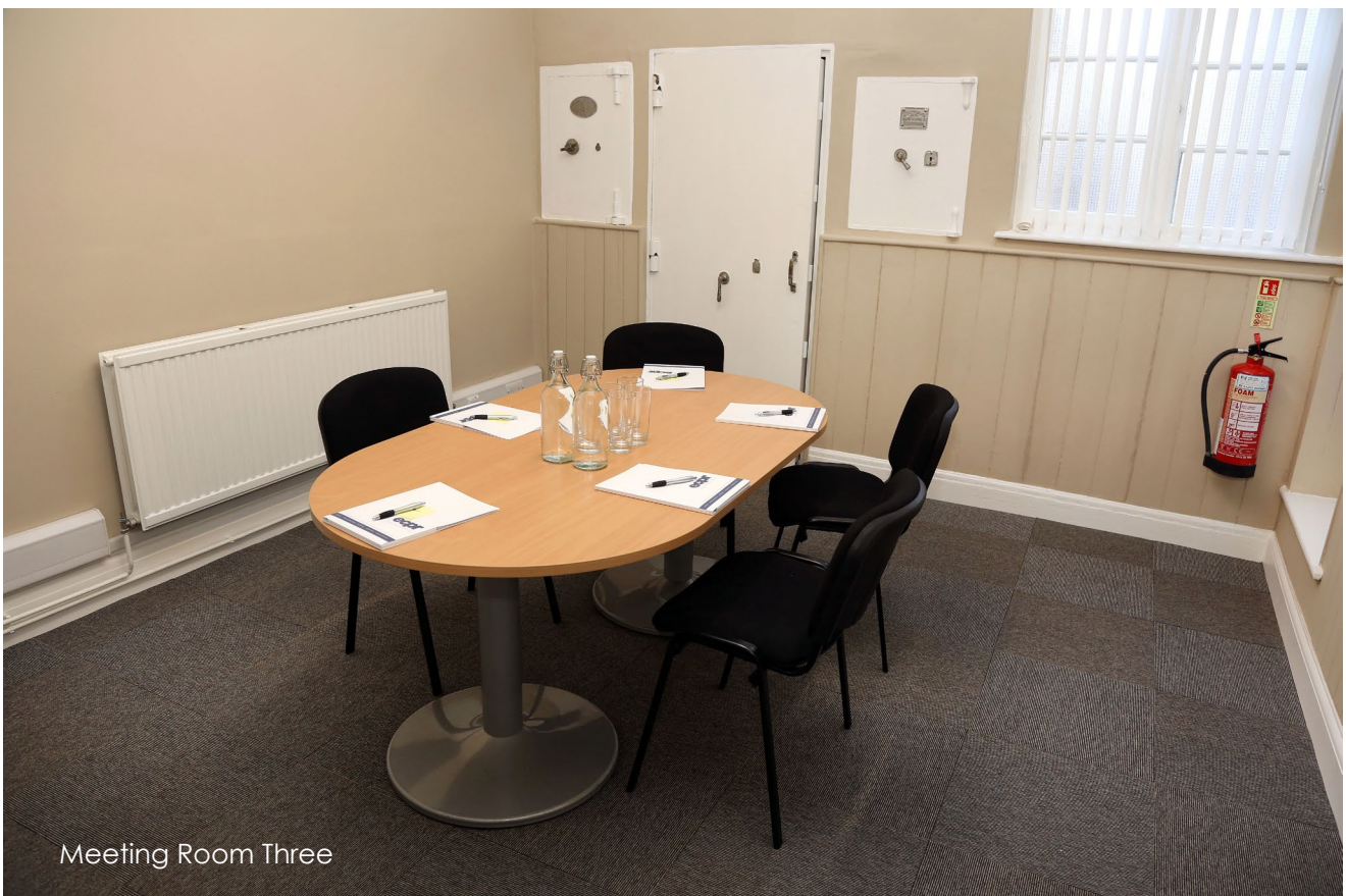
Meeting Room Three